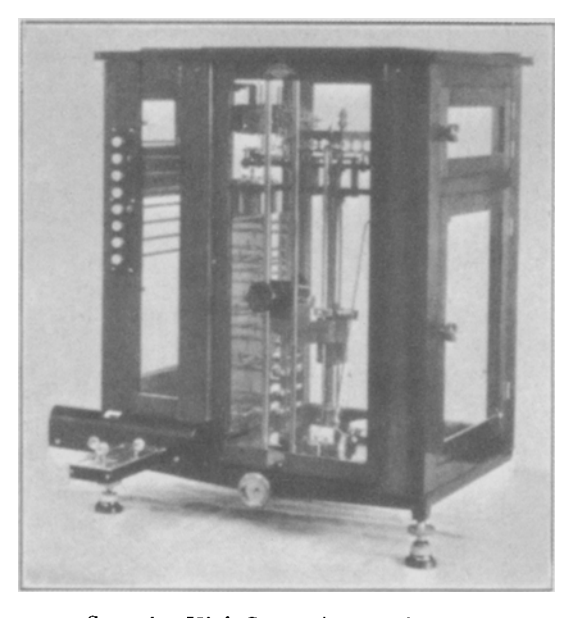
Sartorius High Speed Analytical Balance

A NEW high speed analytical balance, manufactured by Sartorius-Werke A. G. of Goettingen, Germany, has been introduced into the United States. The new balance is termed the Industrial Rapid Balance by the manufacturer and is said to be five times as fast as the ordinary balance because of the complete me-